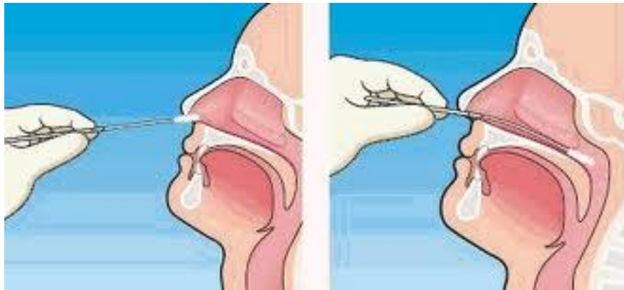
Figure 1 Correct Technique for Taking a Nasopharyngeal swab

For more information see NEJM Procedure: Collection of Nasopharyngeal Specimens with the Swab Technique: http://www.youtube.com/watch?v=DVJNWefmHjE